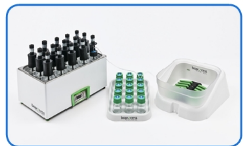
Automatic Methane Potential Test System II

Bioprocess Control is a market leader in providing advanced control technologies for the commercial biogas industry. Visit our website at www.bioprocesscontrol.com